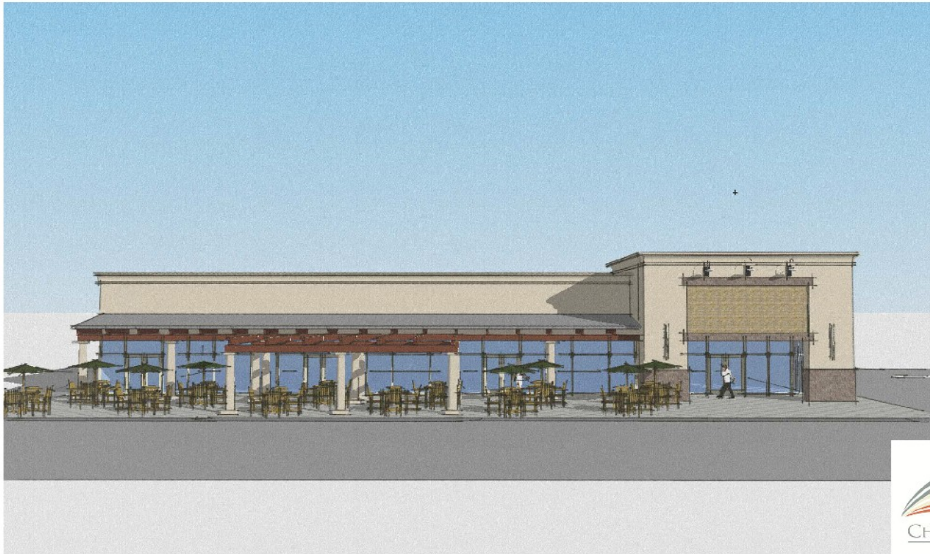
COUNTRY CLUB PLAZA - CORNER DEVELOPMENT

NE Corner of McNeese Street and Nelson Road Lake Charles, LA 70605