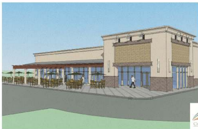
COUNTRY CLUB PLAZA - CORNER DEVELOPMENT